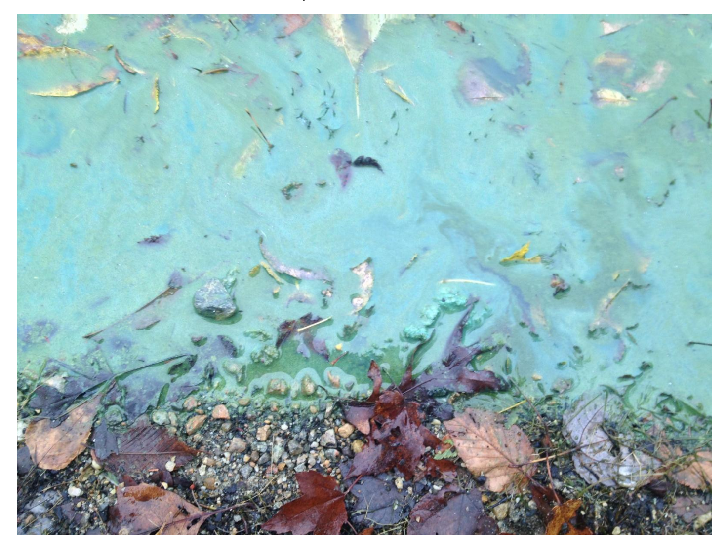
Possible Cyanobacteria at Mansion Beach, 4 October 2012