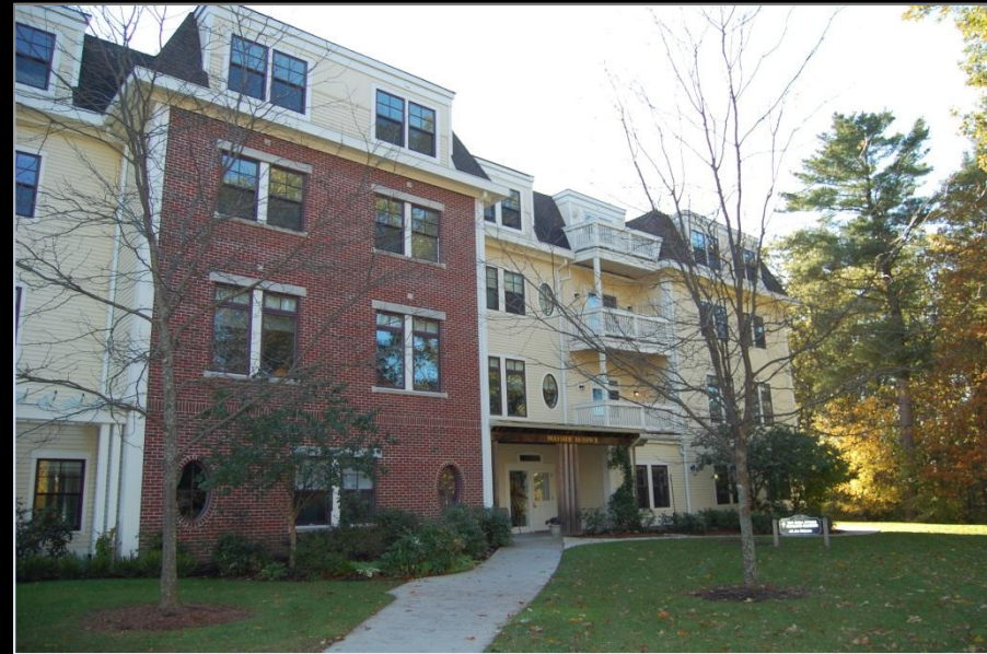
Sample densities at Traditions elderly housing, with 3-4 stories