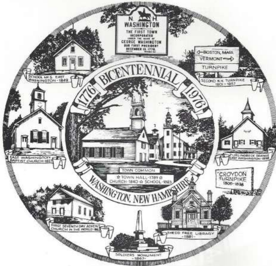
BICENTENNIAL PLATE 1976