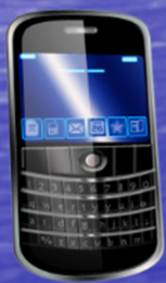
Cell phone $2.67