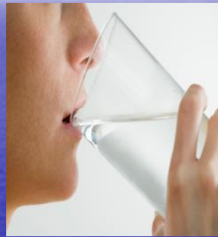
Potable Water Service $1.55