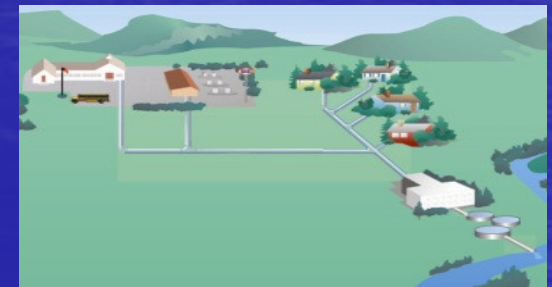
Town Sewer Fee $1.02