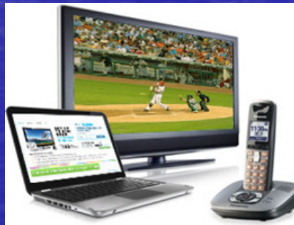
Bundled Services (Cable TV, Internet, Telephone) $4.30