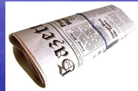
Daily Newspaper $1.50