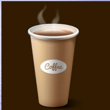
1 Cup of Coffee $2.00