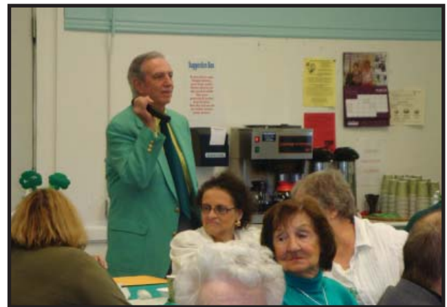
St. Patrick's Day 2011