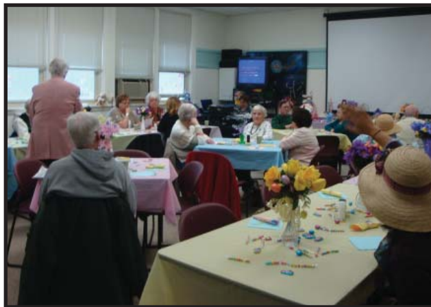
Easter Party 2011