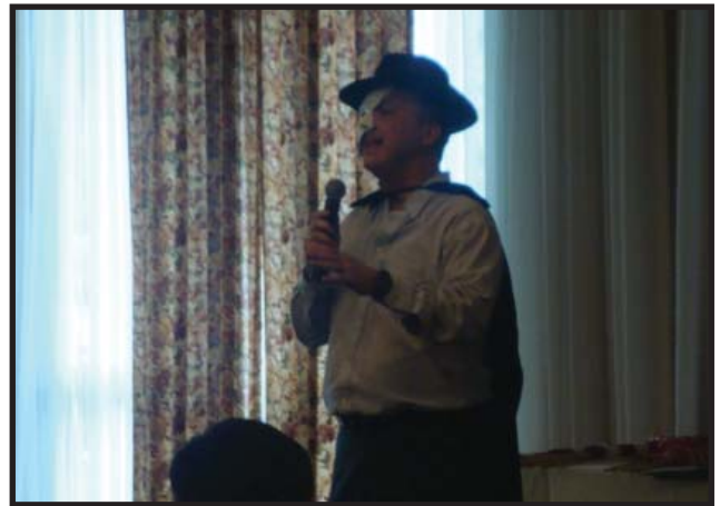
Silver Tea 2011