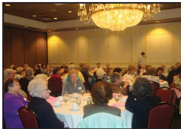
Silver Tea 2011