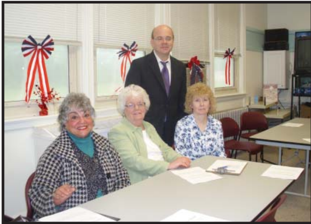
Congress Man Jim McGovern