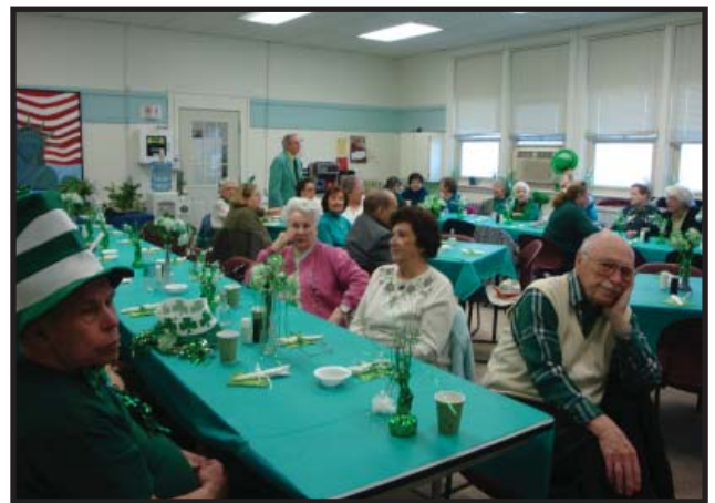
St. Patrick's Day 2011