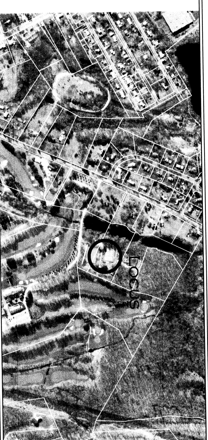
LOCATION (NOT TO SCALE) MAP