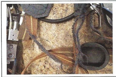
Discolored and damaged/frayed harness