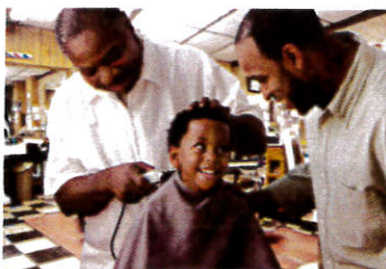
Find the services they need