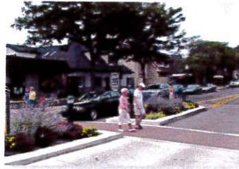
Cross the streets