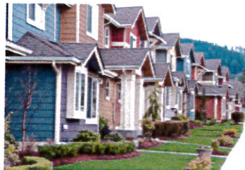
Live safely and comfortably