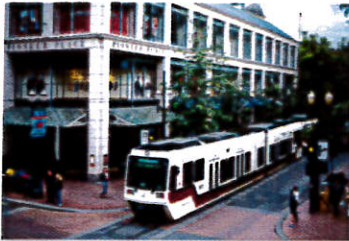
Get around without a car