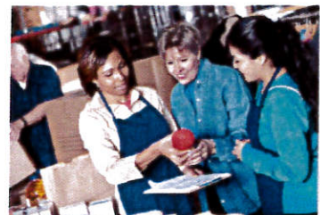
Work or volunteer