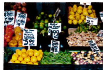
Buy healthy food