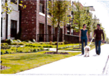
Go for a walk