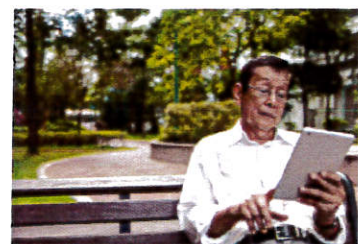
Spend time outdoors