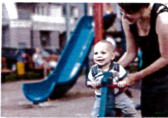
Enjoy public places