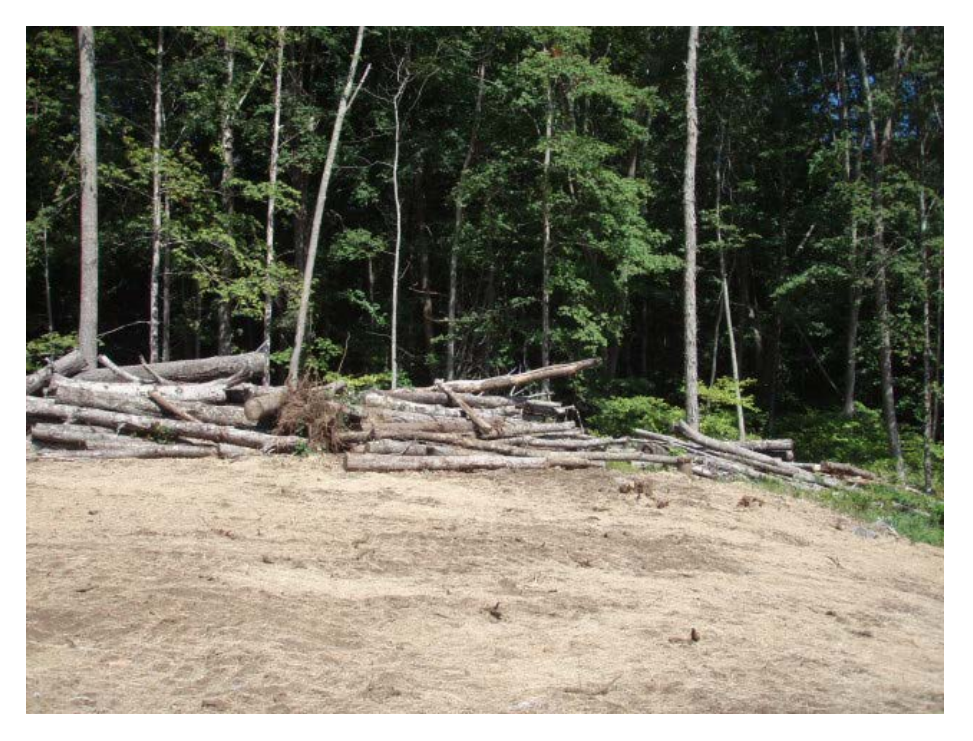
Typical way wood is left for property owners