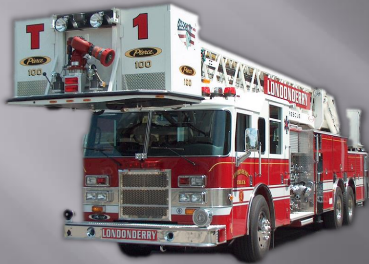
2001 Pierce® Aerial Tower

$400,000 - $500,000 (Refurb & 10 year cert)