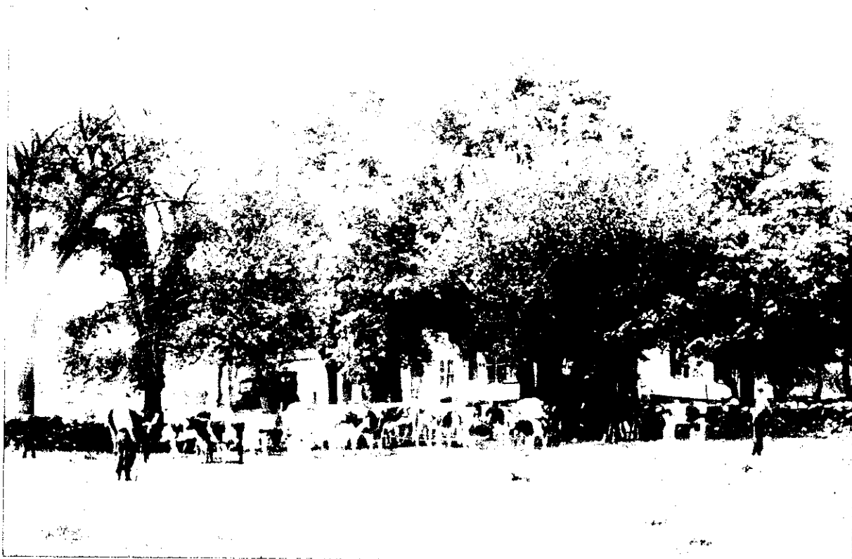
THE ANDERSON FARM AND SLAUGHTERHOUSE, c. 1930. This photograph shows cows at Anderson Farm.