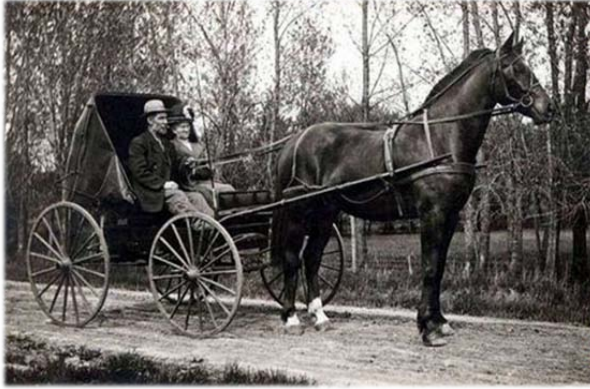
Photo of a 1903 horse and carriage