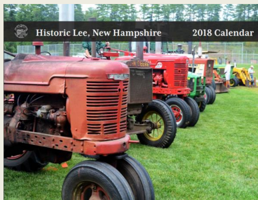
CALENDAR COVER