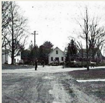
Lee Center School, April 1962.

The Lee Public Library was opened on January 28, 1893, and was located on the 2 nd floor of the Lee Town Hall until 1962, when the library was moved into the former Center Lee School building. The Lee Center School had originally been built in 1897 on Lee Hook Road, south of the present day Jeremiah Smith Grange. The school building was moved in April 1962, a distance of a half mile, to its present location. The move took most of a day. The building, now serving as the front part of the Lee Library, opened as the new library building in April 1964. Since then the Lee Public Library has been enlarged three times; in 1974, 1984, and 1996.