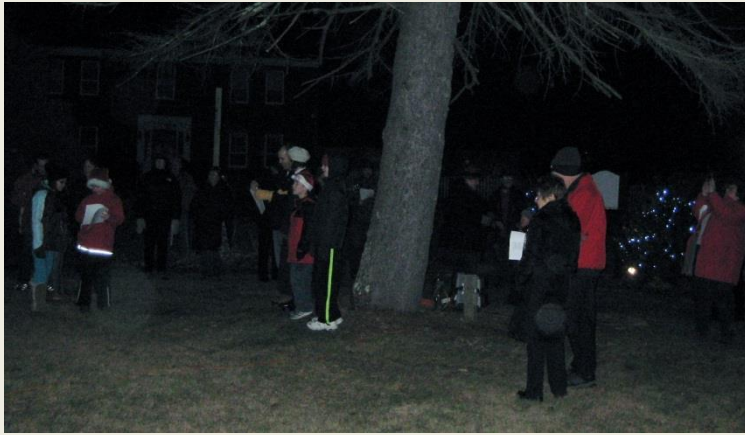
CAROLERS GATHER AROUND THE TREE

$$$$$$$$$$$$$$$$$$$$$$$$$$$$$$$$$$$$$$$$$$$$$$$$$$$$$$$$$$$$