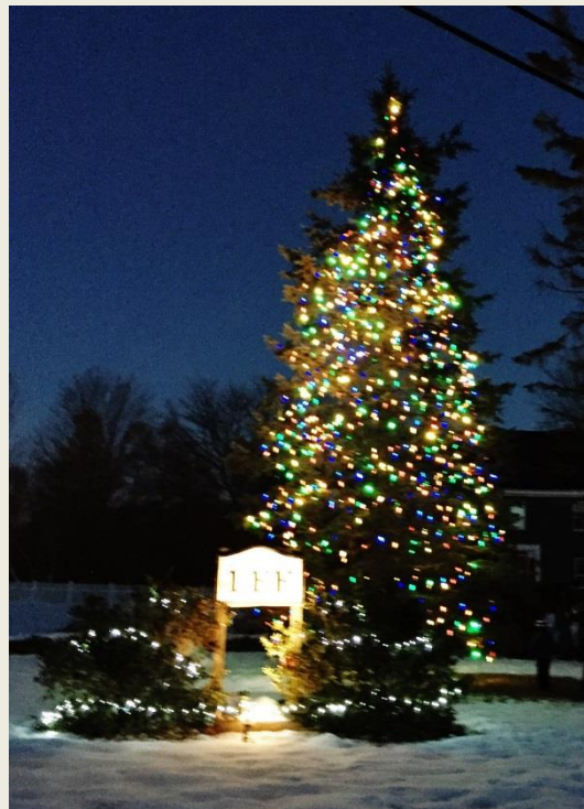
AFTER TREE LIGHTING MUSIC AND REFRESHMENTS SERVED AT THE GRANGE