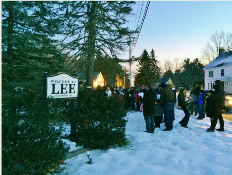
CAROLING PRIOR TO TREE LIGHTING