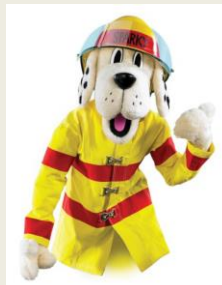
SPARKY THE FIRE DOG

CLICK HERE for Proclamation CLICK HERE for State Fire Marshal Release