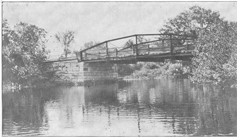
WADLEY'S BRIDGE, LEE, N. H.