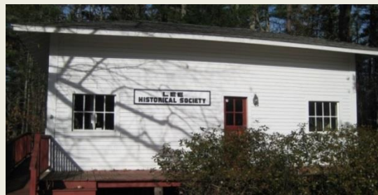
LEE HISTORICAL SOCIETY MUSEUM