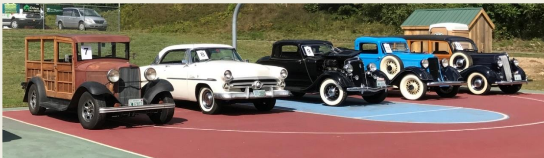
ANOTHER AWESOME LOOKING LINE OF CARS