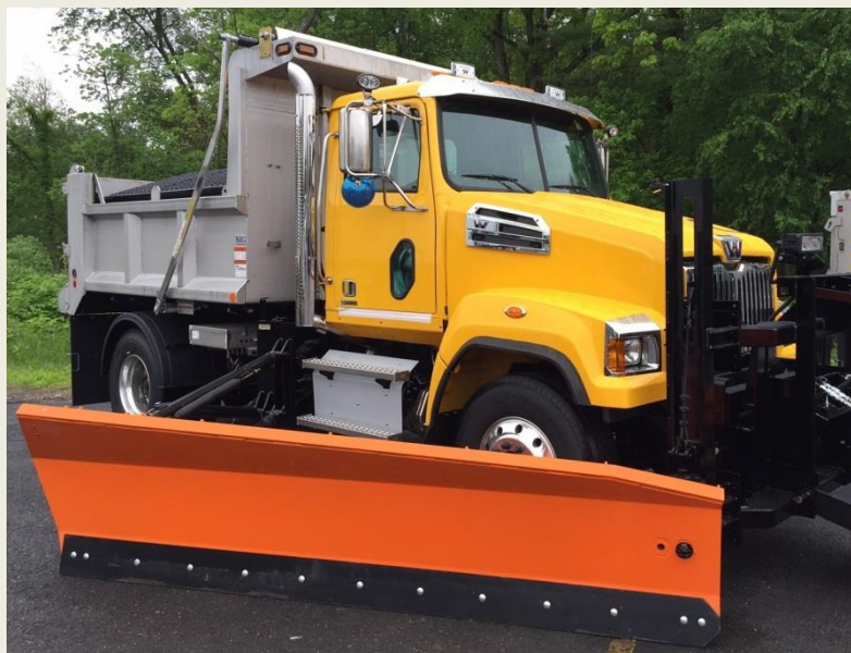
PICTURED HERE IS A SIMILAR TRUCK

THE HIGHWAY DEPARTMENT'S NEW WESTERN STAR CAB & CHASSIS TRUCK HAS JUST COME OFF THE ASSEMBLY LINE TODAY! STAY TUNED FOR ARRIVAL DATE !