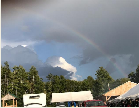
DURING SUPPER AT THE LEE FAIR (AT THE SAME TIME IT WAS POURING IN NEWMARKET!) LEE ONLY SAW A FEW FAT DROPS OF RAIN AND THIS GLORIOUS DOUBLE RAINBOW ARCING OVER THE FAIR. IF YOU LOOK CLOSELY YOU CAN ALMOST SEE THE 2 ND RED STRIPE ABOVE AND TO THE LEFT OF THE TALLEST PINE ON THE RIGHT.