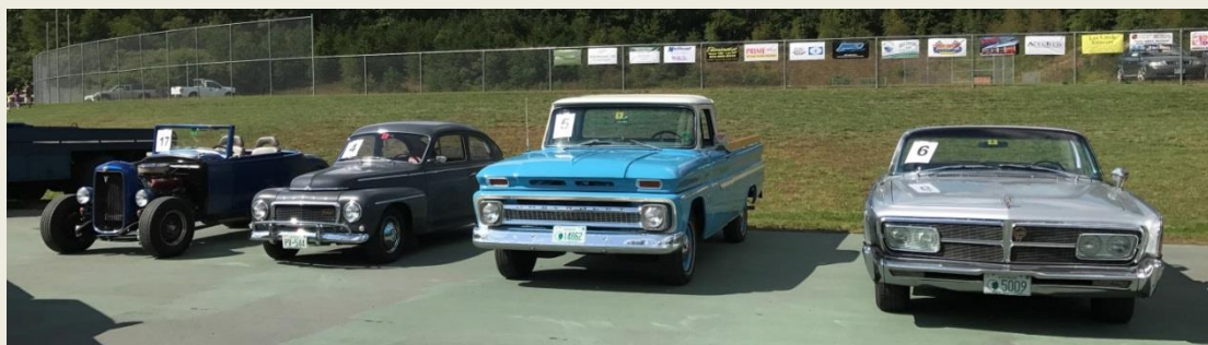
GREAT LOOKING ANTIQUE CAR SHOW