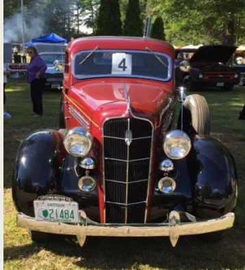
1 ST PLACE – BILL WELCH