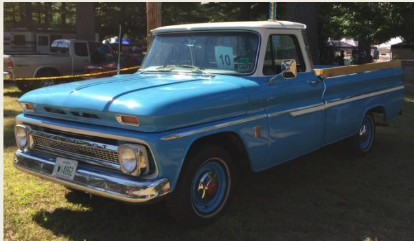
2 ND PLACE – RICKY STEVENS