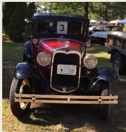
BEST IN SHOW – RONNIE JAMES