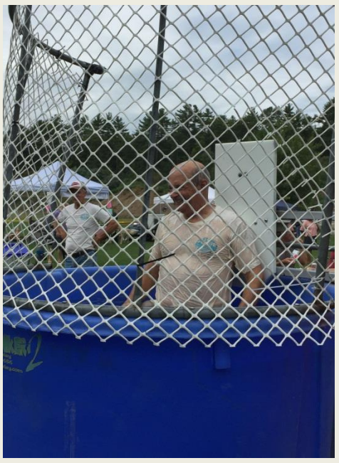
What a trooper!