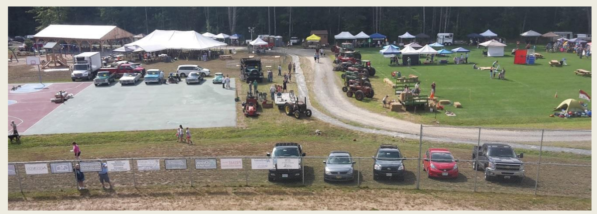
Panoramic View of Lee Fair 2016