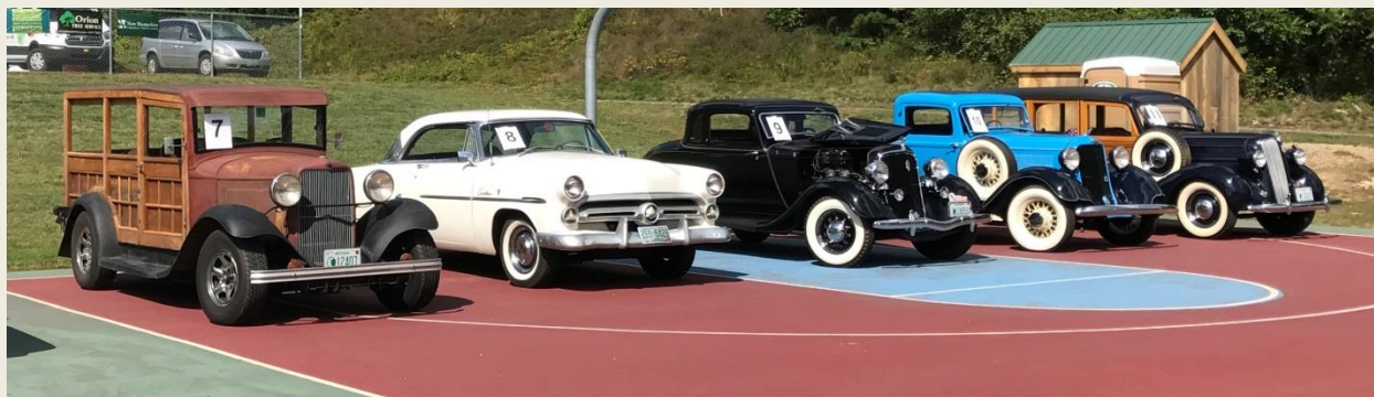
ANOTHER AWESOME LOOKING LINE OF CARS