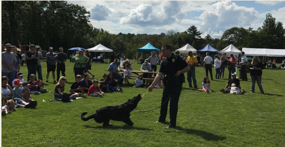
BARRINGTON POLICE K-9 DEMONSTRATION