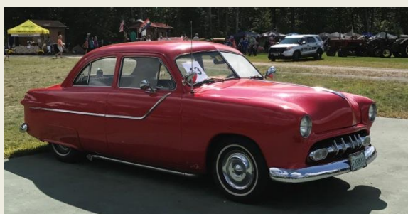
NO ONE PUTS BABY IN THE CORNER....