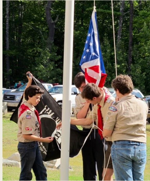
BOY SCOUTS RAISING FLAGS