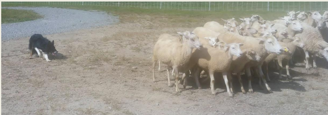
HEART STONE FARM SHEEP HERDING DEMONSTRATION