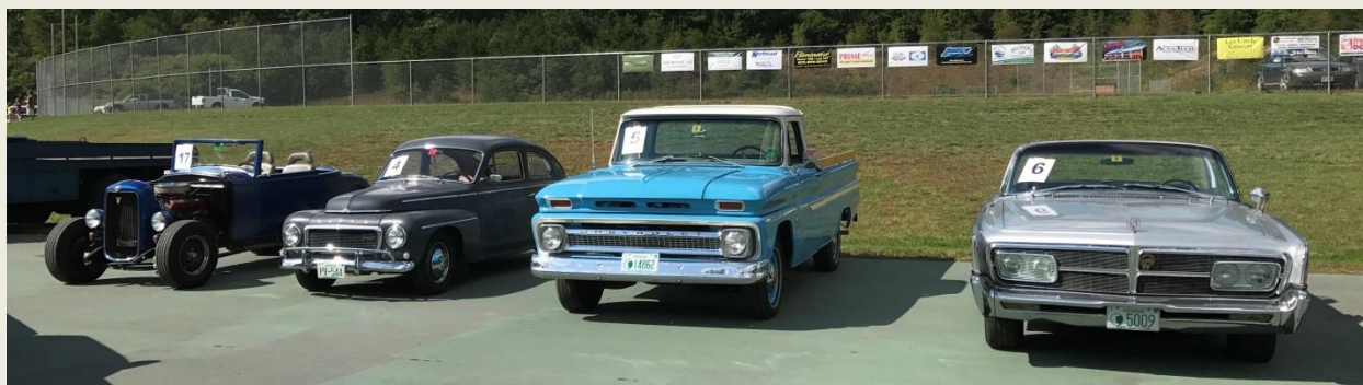
GREAT LOOKING ANTIQUE CAR SHOW