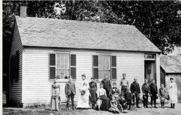
LEE SCHOOLHOUSE 1900