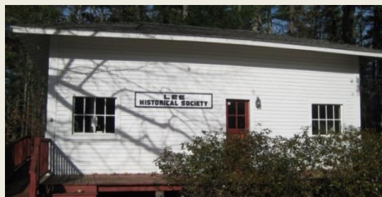
LEE HISTORICAL SOCIETY MUSEUM

OPEN 10am – 2pm every 3 rd SATURDAY of each MONTH APRIL - NOVEMBER