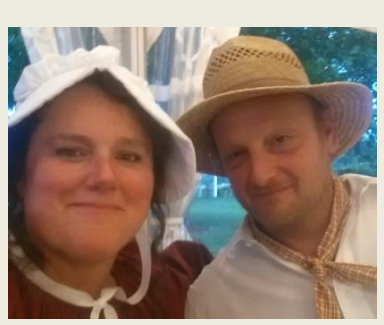
CAREN & SCOTT ROSSI