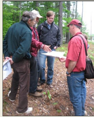
May 29 th Site Walk