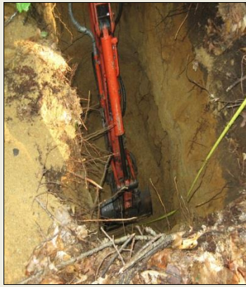
Measuring the depth for Pit #1