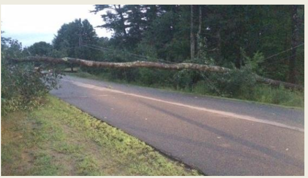
Tree Down on Kelsey Road Tree D