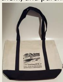
Large Tote Bag $15

The Lee Heritage Commission is offering Lee Town Keepsake Tote Bags for sale this summer. They are generously sized, reasonably priced, useful all year round, and a great memento of Lee, NH. You can see them, compare them, and purchase them at the Lee Public Library.