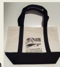
Small Tote Bag $10