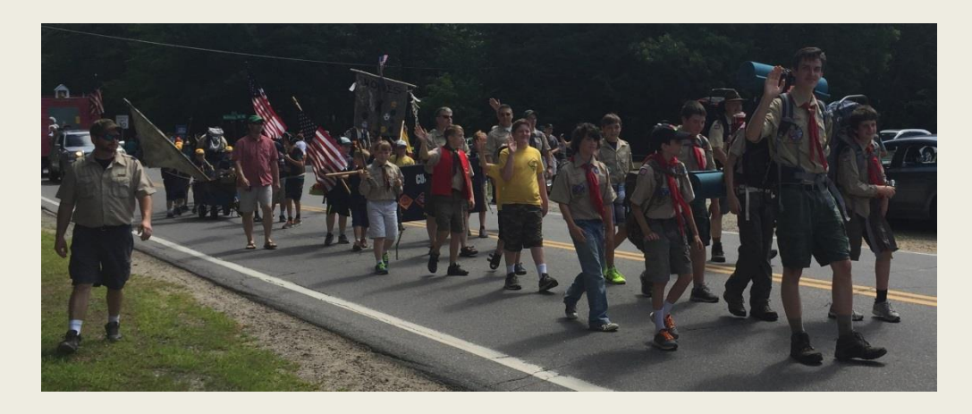
Most Creative - Mast Way School