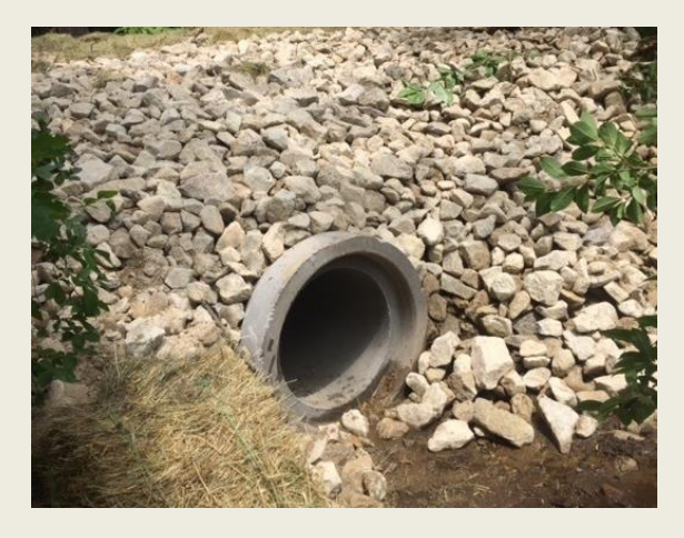
Hayes Road Completed Culvert