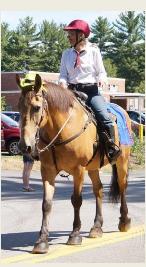
Best Farm – Burley-DeMeritt Farm