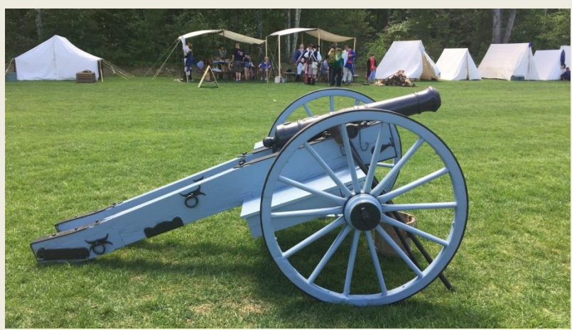
Colonial Brigade Encampment