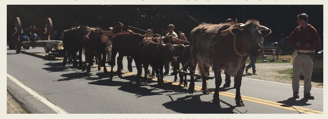
PARADE AWARD RECIPIENTS Best Non-Profit – Lee VFW #1076