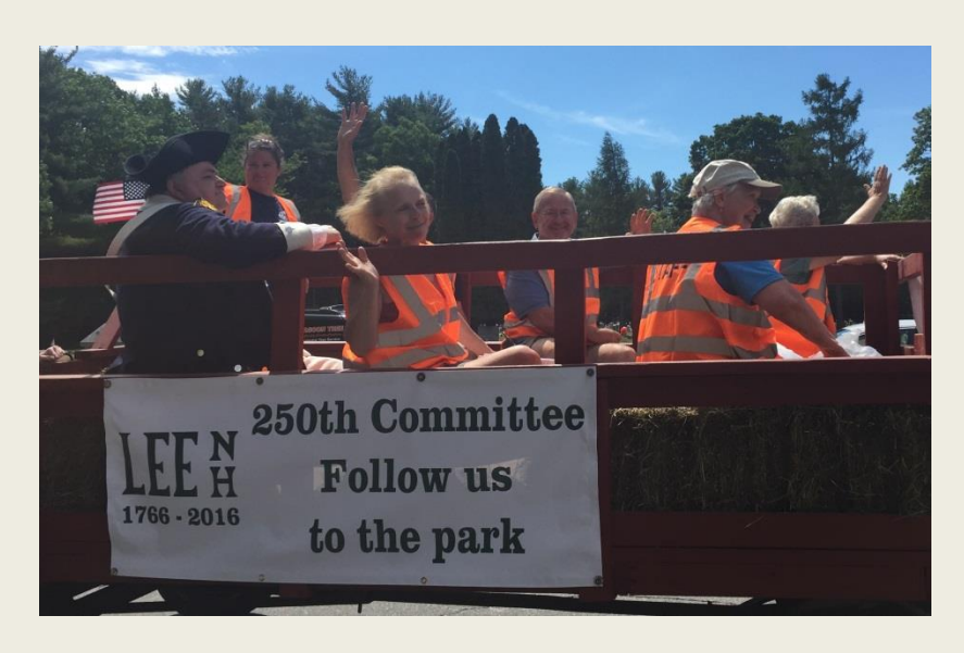
WHAT A GREAT PARADE!!! NOW ONTO LITTLE RIVER PARK!