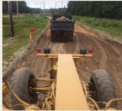
Pinkham Road Project