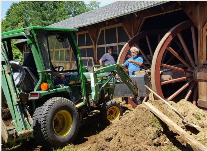
Then when they finally get the wheels out!