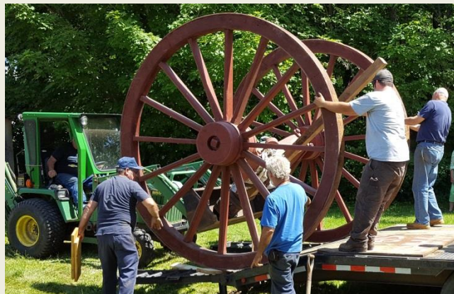
They roll them onto the flat bed to bring them to Lee.