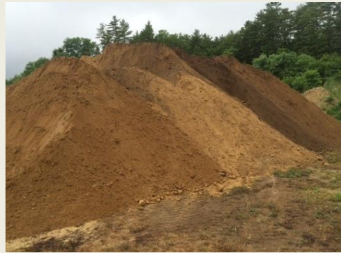
Loam from Pinkham Road now at LRP – photos by Randy Stevens