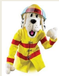
Sparky the Fire Dog® NFPA.org

SAFETY EDUCATOR NEWSLETTER CLICK HERE for the Summer 2016 Edition CLICK HERE for IN THE NEWS JULY 2016 Edition