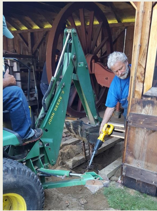
They had to dig a trench to get the wheels out of the barn.