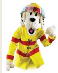
Sparky the Fire Dog® NFPA.org