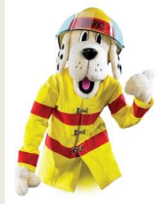
Sparky the Fire Dog® NFPA.org

SAFETY EDUCATOR NEWSLETTER CLICK HERE for the Summer 2016 Edition