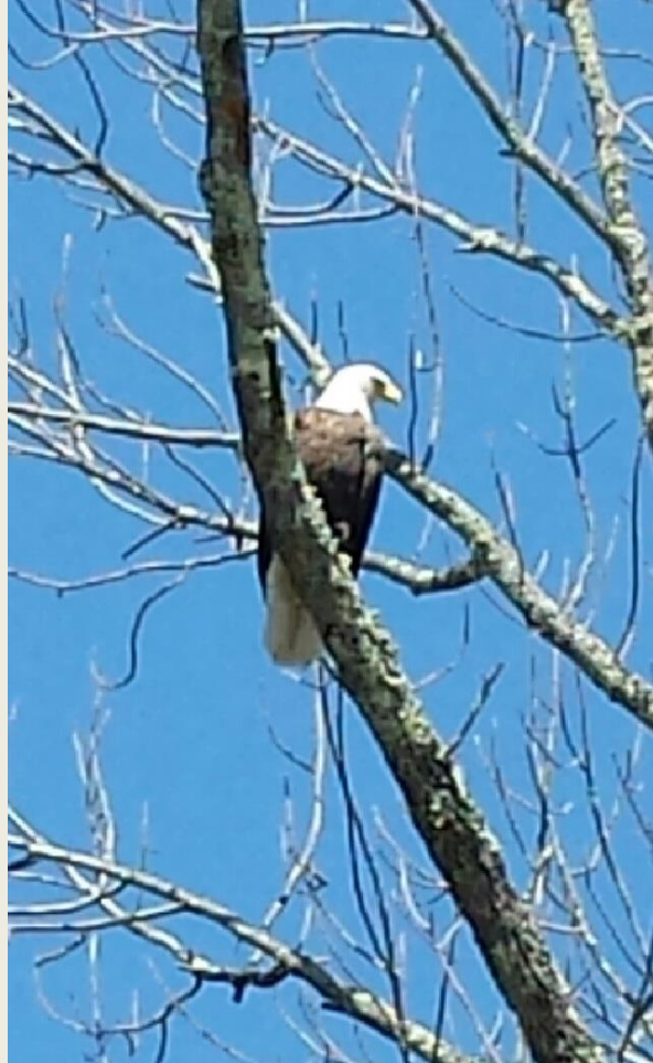
TAKEN IN FRONT OF THE LEE CHURCH