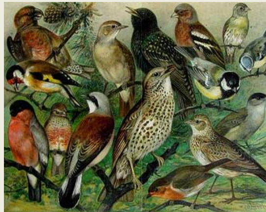
1894 Antique Native Species Birds Print

If you are pregnant, know someone who is, or just had a baby, Community Action can help. We have a free Home Visiting program for teens and women age 25 and under. Call CAP's Home Visiting at 603-516-8108 to talk to one of our staff and learn more. For more information, visit www.straffordcap.org .