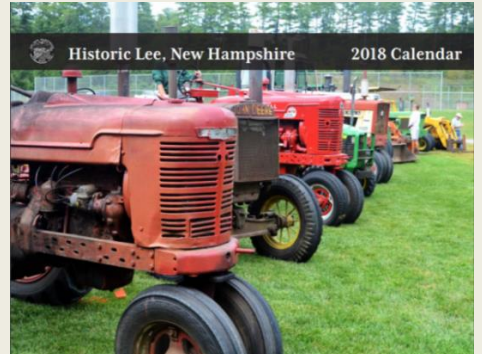
CALENDAR COVER