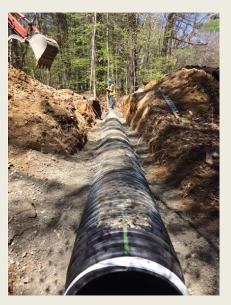
24" diameter culvert

This week the Department replaced two defective culverts (12'' \times 60'') and 24'' \times 60'') on Lamprey Lane. Replacement of a third culvert (24'' \times 60') was planned; however, conditions were too wet to do it. Hopefully, next week the ground will dry up and the 3<sup>rd</sup> culvert can be installed.