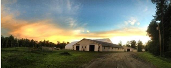
Boulder Brook Stables