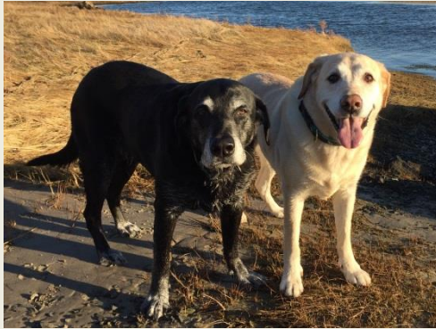
DUNCAN & BODIE (the Town Secretary's pups)

AVOID A $25.00 FINE BY REGISTERING BY APRIL 30 TH . $6.50 for SPAYED/NEUTERED Dogs & Puppies (4-7 months) $9.00 for UN-ALTERED Dogs