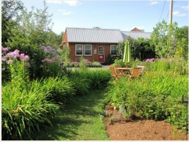
Misty Meadows Herbal Center