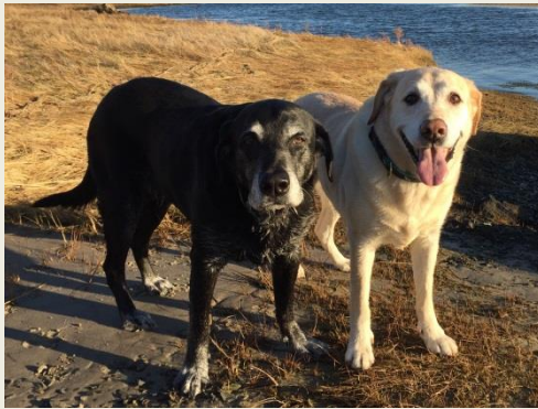
DUNCAN & BODIE (the Town Secretary's pups)

AVOID A $25.00 FINE BY REGISTERING BY APRIL 30 TH . $6.50 for SPAYED/NEUTERED Dogs & Puppies (4-7 months) $9.00 for UN-ALTERED Dogs