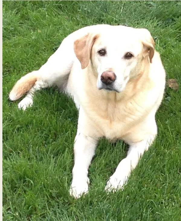
BODIE (the Town Secretary's pup)

TIME TO REGISTER YOUR BELOVED PUP AT THE TOWN CLERK'S OFFICE!