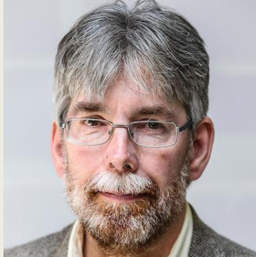
Glenn A. Knoblock – Photo Credit nhhumanities.org