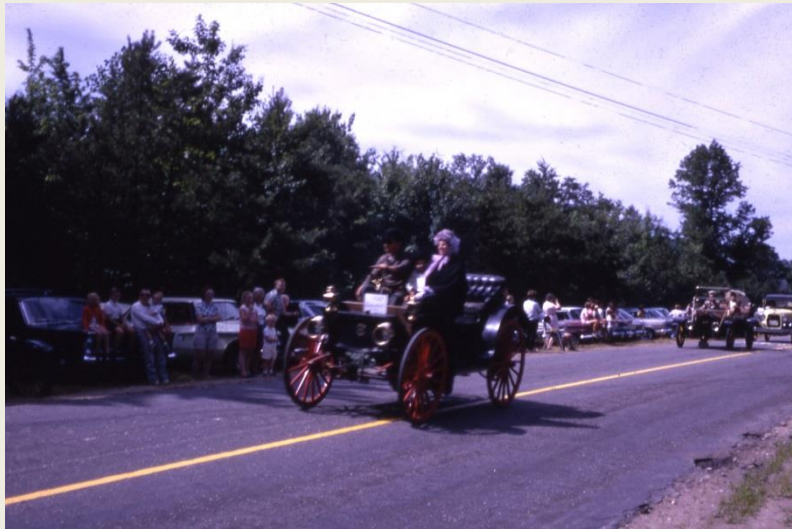
Lee Bicentennial Parade: Antique Cars (1966)

Anyone interested can pick them up at any of our events or at the Lee Library. Through a variety of activities, the passport encourages you to explore our town, past and present, in unique ways. At the end of our Semiquincentennial year, participation will be rewarded. Especially of note to all of our artistic folks is the "Image-In-Lee" program which calls for art of any kind which will be exhibited during our closing ceremony and beyond.