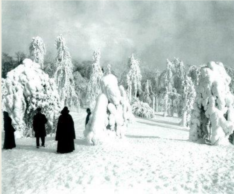
Blizzard of 1904