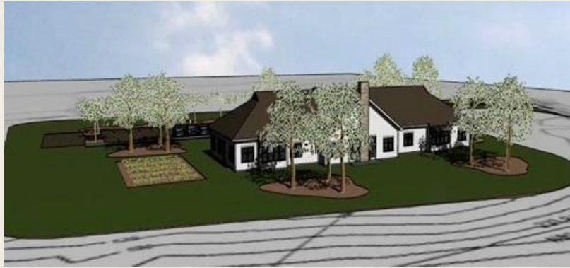
SOUTHERN ELEVATION FACING LITTLE RIVER PARK