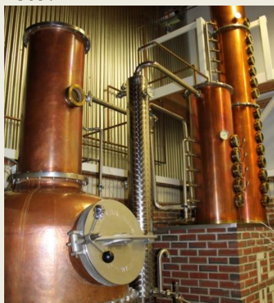
Flag Hill's Christian Carl still

A – General John Stark Vodka is made at the Flag Hill Distillery & Winery on North River Road in Lee NH. According to their website, "Flag Hill Distillery blazed the trail for the booming craft spirits industry that exists today in New Hampshire. Over 12 years ago Flag Hill began producing world class spirits with a Christian Carl still and partnerships with our local New Hampshire Farmers". Christian Carl is a company in Eislingen, Germany that has been manufacturing quality stills since 1869!