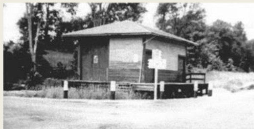
The Lee Historical Society Building was originally the South Lee Freight Depot.

CLICK HERE for the third article from the Town Center Vision Committee outlining the conditions of the town center buildings and plans to address those conditions. In the next few weeks there will be information regarding the purchasing a piece of property from the Lee Church Congregational located between the Church and the town center.