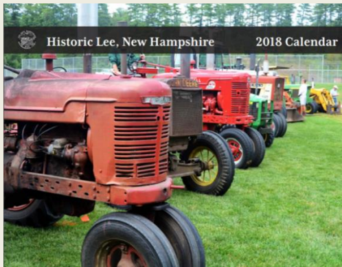
CALENDAR COVER PHOTO BY GERALD SEDOR