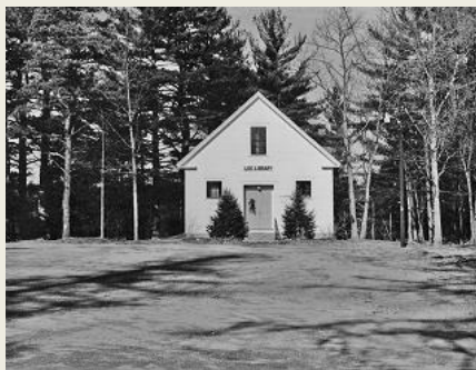
The Lee Library in 1975 at Town Center after it was moved from the Lee Hook Road location.

CLICK HERE for the second article from the Town Center Vision Committee outlining the conditions of the town center buildings and plans to address those conditions. In the next few weeks there will be information regarding the purchase of a piece of property from the Lee Church Congregational located between the Church and the town center.