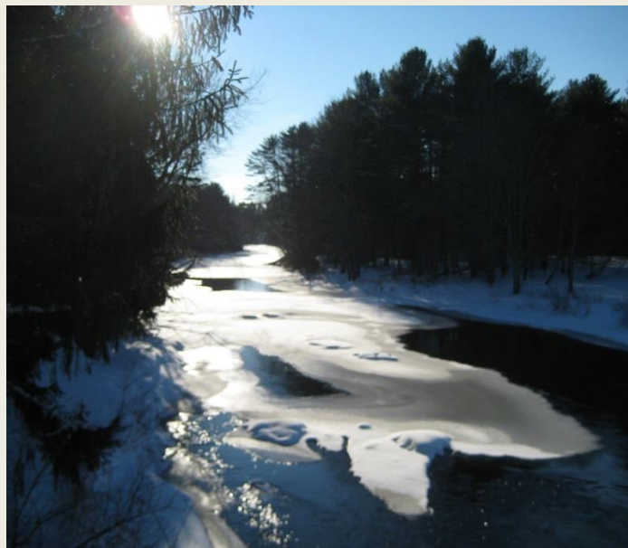
THE BEAUTIFUL LAMPREY RIVER

PETITION WARRANT ARTICLES MUST BE SUBMITTED TO TOWN HALL BY 4:30PM ON JANUARY 14, 2014