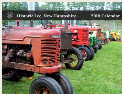
CALENDAR COVER