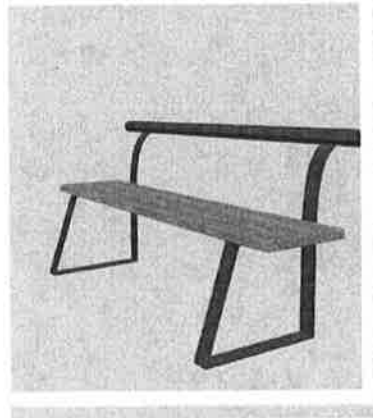
Bench view 1

Design a park bench and drop off your submission at the Franklin Studio on 366 Central Street for a chance to have your design chosen and constructed for downtown Franklin and you could also be the winner of a cash prize!