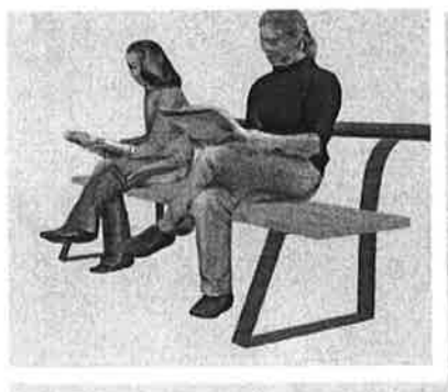
Bench view 3