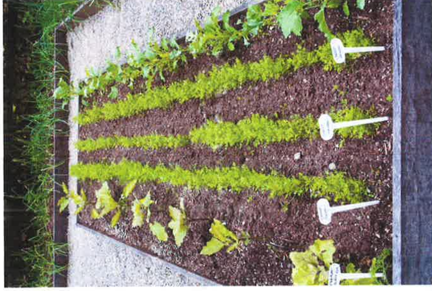
Created by HeatherVision ©2015

There is joy in providing fresh produce for your neighbors in need. What a great feeling when you drop off your bounty at the pantry.